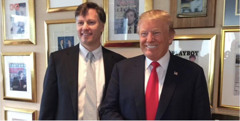
Christopher Landau and President Donald Trump.

Now a big chunk of the migration issue is not Mexican. That is been overshadowed now by third country migration. As we look ahead towards relations for the rest of the century, after you and I are gone from the scene, I suspect that this will be an ongoing challenge for both countries. It's important for both countries to bring some fresh thinking because now we're talking about people flying in from Bangladesh, Congo, Kazakhstan. It's like the United Nations there on the border. To have unregulated flows of people entering the country it's not in Mexico's interest either.