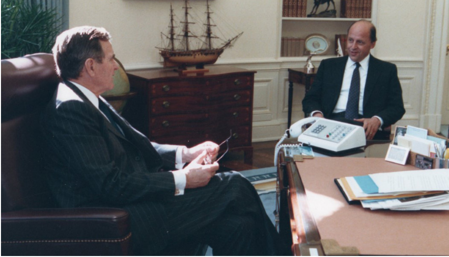
John D. Negroponte and President George H.W. Bush in a meeting at the White House.