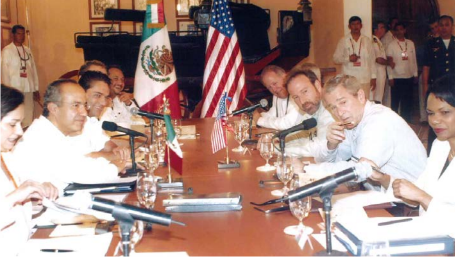
Ambassador Garza, Presidents Calderón and Bush, and Condoleezza Rice in a working meeting.

There were reports at the time that Derbez and you did not get along well. I remember you being called to the Foreign Ministry because of a statement you made about violence on the border scaring away investment. How was your relationship with Derbez?