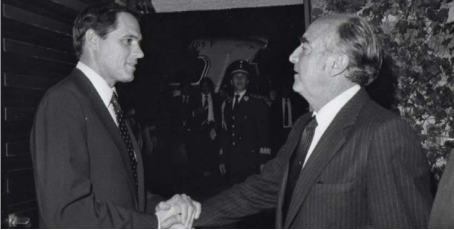
John A. Gavin and José López Portillo at the ambassador's residence.