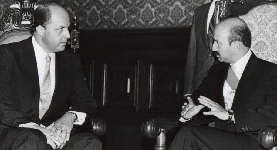
John D. NegroponTE and President Carlos Salinas de Gortari in a meeting at Los Pinos.

a unique history and even then, we had a growing Hispanic population in the United States the majority of which was Mexican. There was a lot of awareness of the complexity and extent of the relationship and we know it's about economics, about trans-border issues and it's about the growing Hispanic community in the United States which has only become more important.