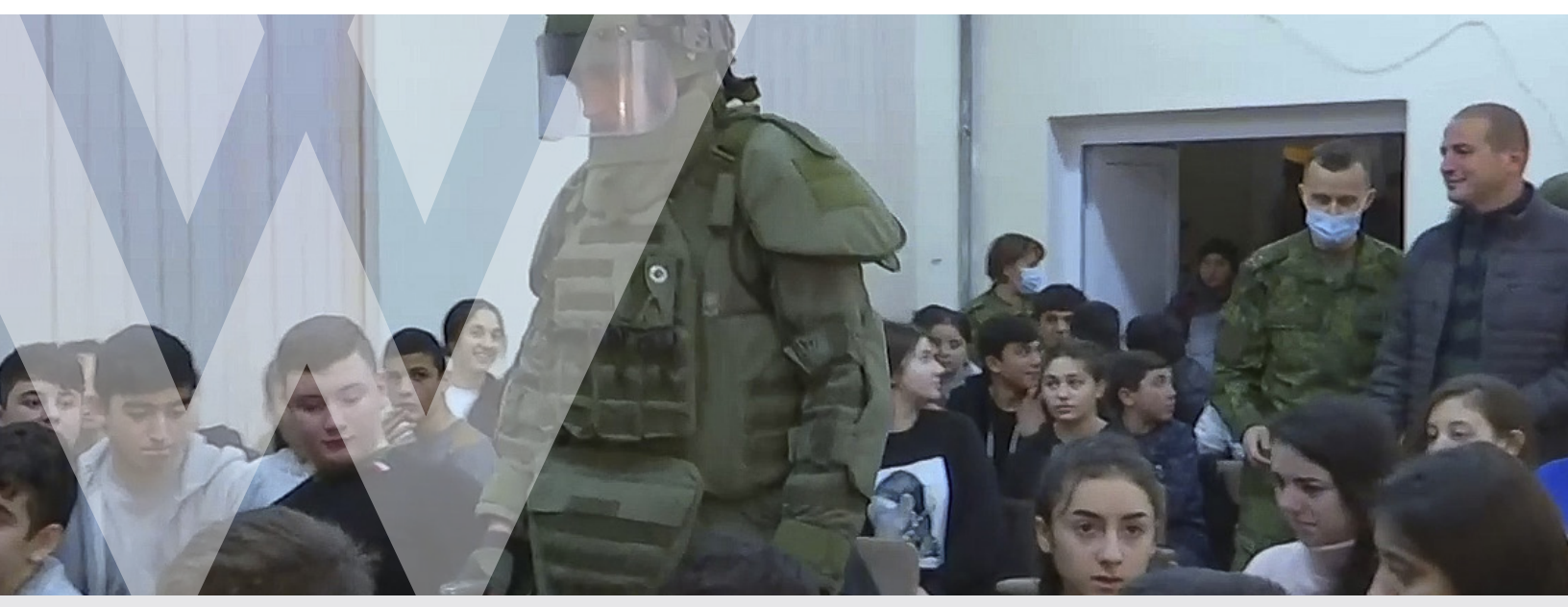
24 December 2020 Russian peacekeepers holding security classes with pupils of one of Stepanakert's school in Nagorno-Karabakh