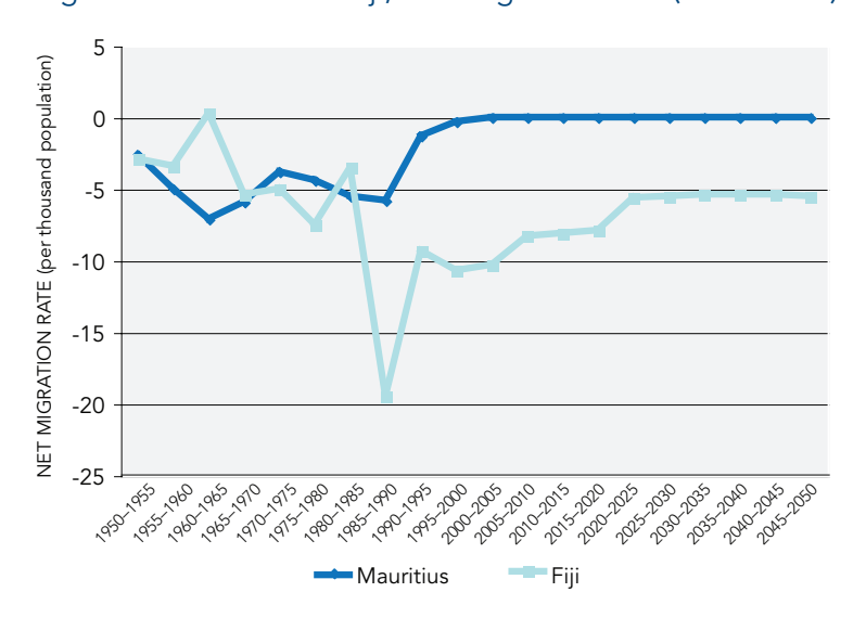
Figure 3: Mauritius vs. Fiji, Net Migration Rate (1950–2050)