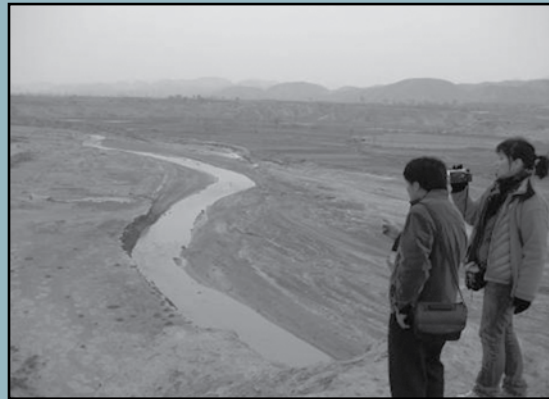
Many of China's grassroots groups conduct surveys of river basins, sometimes bringing volunteers to educate them on the overall health of the river on which they depend.

The young leaders of such green groups represent the generation in China that grew up during the country's opening and reform. The fact they