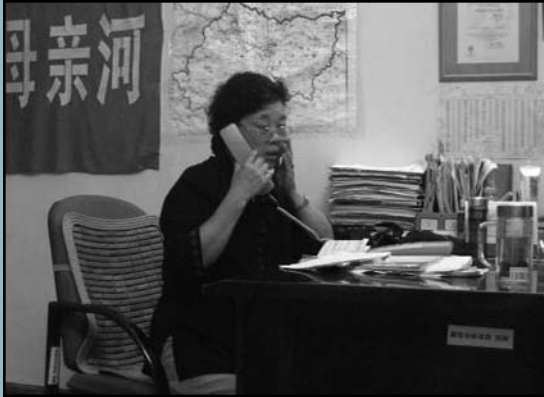
Green Hanjiang acts as a liaison between local communities, government and businesses. For example, this photo shows the head of Green Hanjiang calling the environmental protection bureau about a new waste pipe the community had discovered flowing into the river. The EPB was also investigating it and she was able to inform the community when the pipe was to be removed.

Hundreds of miles away in Anhui, Zhao Zhong's home province, another community-based group, Green Anhui, is working to protect the Huai River. Green Anhui staff and volunteers have hiked huge stretches of the notoriously polluted Huai River, meeting with communities, learning their concerns, and educating them about water conservation practices.