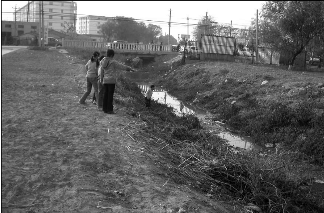
Xinzhi school students investigating the pollution sources along the Xinzhi River.