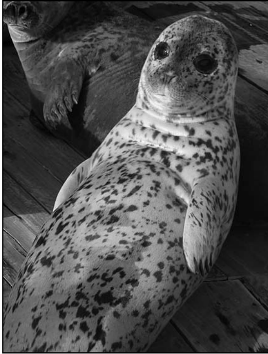
Popularity of spotted seal has led to increased catching from the wild to supply zoo and aquariums. A spotted seal pup at Dalian SunAsia Ocean World.

Nuclear power currently supplies only 2 percent of total electricity output. Notably, while the planned nuclear plant construction is faster than any other country in the world, China's energy demand is growing so rapidly that in 2020 coal will still supply nearly 70 percent of the energy and nuclear power would make up only 5 percent of the total.