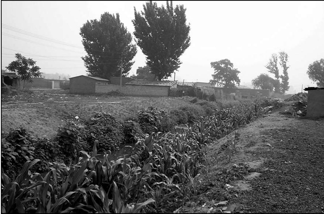
Xinzhi School students found one wastewater disposal pipe almost every ten meters along the river.

Using their initial research, the students and teachers designed a survey to evaluate local villagers' knowledge and perceptions of water pollution in the Xinzhi River. Questions included: