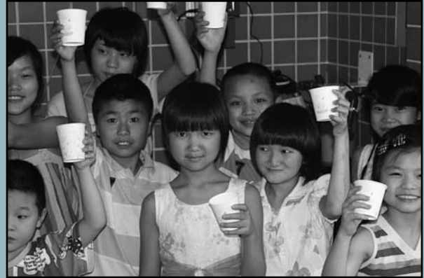
The children are always excited at having their first cup of truly clean tap water.

In the orphanages we have worked, all the water for cooking, drinking, and infant bottles now comes from our water systems. We have seen in the last three years of working in China's orphanages, as well as orphanages around the world, that a dramatic reduction in stomach maladies and diarrhea has occurred after the orphanages switched over to our water systems. At all of the orphanages in China where we have worked, staff members tell us they see a rapid decrease in "the number of times children go to the potty." For example, in one orphanage in Guangdong Province, the staff noted that they typically had to deal with 10 to 12 outbreaks of diarrheal