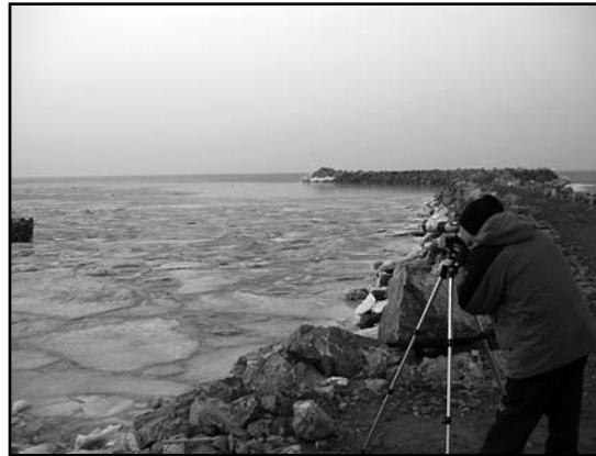
Yoon Sanghoon, coordinator of the Eco-system Conservation team of Green Korea, looking for spotted seal along Dalian’s coast.

Northwestern China, particularly Xinjiang and Qinghai, has for decades been the site of nuclear weapon testing and uranium mining, which even government documents have identified as the source of higher cancer rates and other illnesses among people living close to the sites. 1 Such testing also has